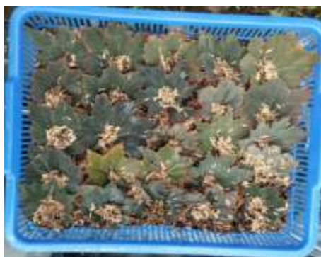
Figure 1. Planting Model

The research uses two factors. The first factor, the cutting material, consists of whole and sliced leaves. The second factor, namely the concentration of Rootone F, consists of 250 ppm, 300 ppm, 350 ppm, and 400 ppm. Each treatment was combined to create eight combination treatments. For each combination treatment, 25 cuttings were planted in 1 germination tank in five longitudinal and five transverse positions.